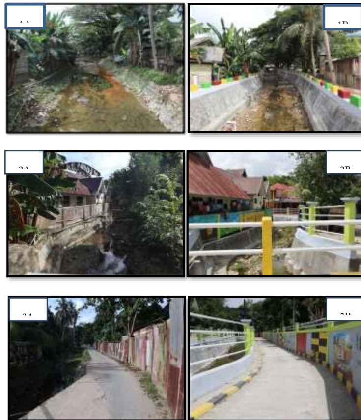
Figure 1a. Efforts to Handle Slum Areas;(A) Before Handling, (B) After Handling

The research findings on the determinants of slum indicators show that the evaluation of changes, benefits, and impacts based on hands in comparison of slum settlements before and after the implementation of the slum management program in Kendari City, is perfect and successful. This is evidenced by various handling efforts at the Ward level, which have shown better environmental conditions.