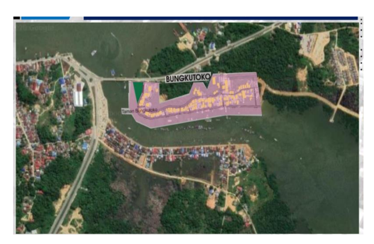
Figure 3. Bungkutoko Village