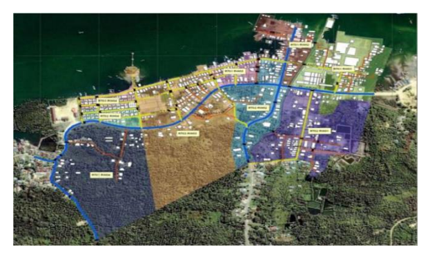
Figure 1. Lapula village

The samples for the coastal area of Kendari City are Lapulu Sub-District, Poasia Sub-District and Bungkutoko Sub-District.