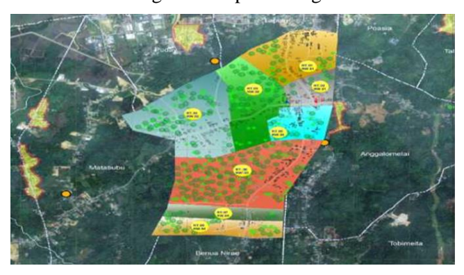
Figure 2. Poasia Cillage